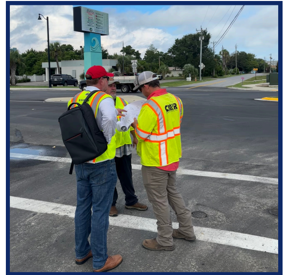
Members of the CRA Team reviewing plans during the walk-through.