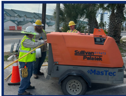
FPL with contractor MasTec preparing conduit on Front Beach Road this past January.