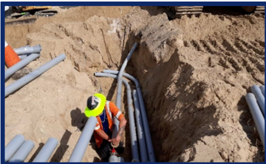
Utility conduits being installed along Front Beach Road in July 2022.

The CRA Plan requires most aerial utility lines to be moved underground during the road construction process, usually in conjunction with installing new water and sewer lines. Relocating utilities can often lead to encounters with known, unknown, unmarked or abandoned utilities. This makes for a delicate and challenging operation, as crews must first coordinate with utility companies to ensure there is no disruption to public services such as electricity, cable television and internet.