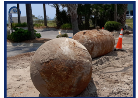
Unmarked propane tanks found within the right-of-way near beach access 64 in July 2023.

To sign-up for newsletters, or with a public record request or inquiry, please contact: