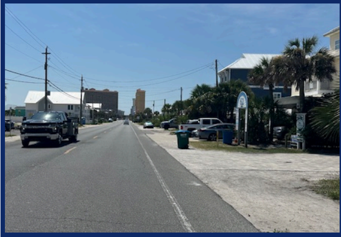
Looking east on Front Beach Road in Segment 4.1 near beach access 62.