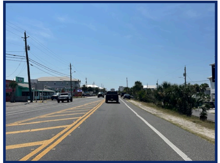
Looking east on Front Beach Road in Segment 4.3 near Azalea Street.

To sign-up for newsletters, or with a public record request or inquiry, please contact: