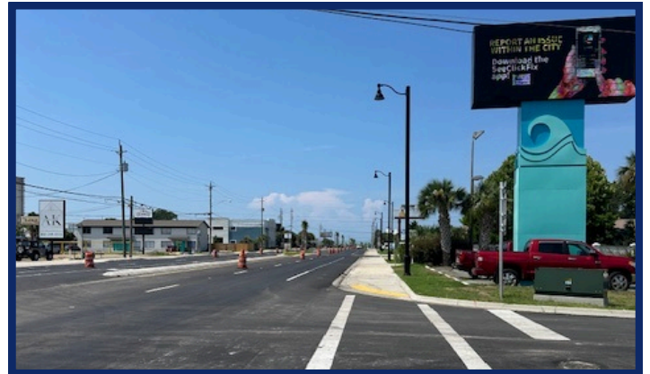
Looking north and south on South Arnold Road.