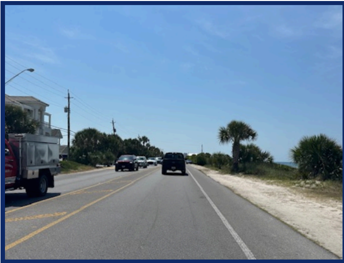
Looking east on Front Beach Road in Segment 4.2 near Bid-A-Wee Beach.