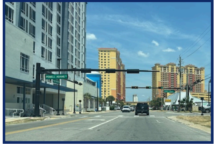
Looking west on Front Beach Road in Segment 4.1 at the Powell Adams Road intersection.